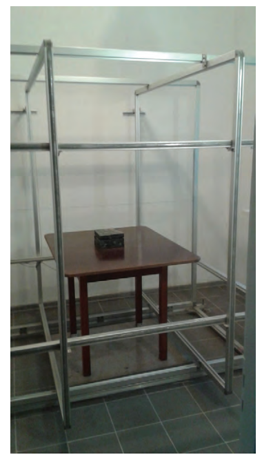
Fig. 3. The coil developed in the Central Geophysical Observatory of the Institute of Geophysics of the Polish Academy of Sciences in Belsk used to check the proton magnetometer

In case of divergence exceeding the expected values the frequency of the internal generator magnetometer should be properly adjusted. Checking the non-magnetism of the probe proton magnetometer, by determining whether the results of measurements are independent of the orientation of the probe is also very important. As a rule, checking is performed in four set-ups: NS, SN, EW, WE. In addition, the record of the proton magnetometer should be compared with the record of another trustworthy magnetometer, for example the one used in the observatory. This is done by measuring the module F of the total intensity vector of the geomagnetic field in observatory conditions after placing the magnetometer probe on the appropriate pillar. Differences between the results of measurements obtained from the magnetometer being checked and from the base magnetometer in the observatory after averaging provide the correction which should be taken into account in the processing