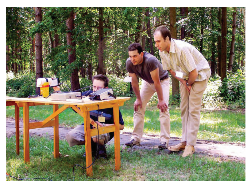
Fig. 2. Comparison of proton magnetometers

Magnetometer DI-fluxgate with - a non-magnetic theodolite with a magnetic sensor – and a proton magnetometer are currently used for the absolute measurement of the geomagnetic field components in geomagnetic observatories (Jankowski and Sucksdorf, 1996) and in field conditions (Barraclough, de Santis, 2011; Newitt et al., 1996). The theodolite with the magnetic sensor cap must be checked and certified as any surveying instrument. Absolute measurements of the magnetic declination and inclination require prior determination of the true north direction. After setting up the theodolite on the base pillar (Fig. 4) in the geomagnetic observatory the procedure of the determination of the instantaneous direction of magnetic north and thus the instantaneous value of the magnetic declination is carried out. The direction of the true north for