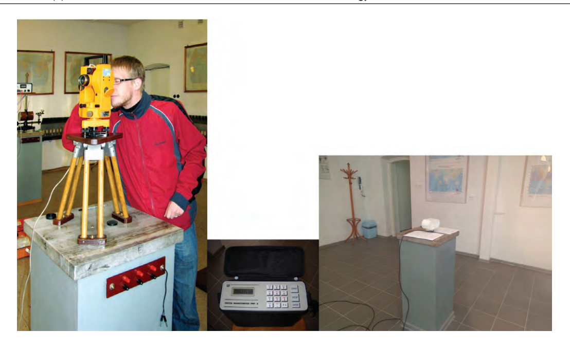
Fig. 5. The measurement of magnetic declination, inclination and module F of the total intensity vector on the base pillar in Belsk observatory

it can be assumed that the tested magnetometer works correctly. In the case of checking the DI-fluxgate magnetometer, after the control measurement session in the geomagnetic observatory (Fig. 5) the instantaneous differences between declination and inclination obtained from the tested magnetometer and the observatory magnetometer are calculated.