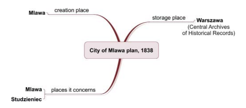
Fig. 1. Multi-spatial object - few space relations of one monument

Moreover, one single document can be connected or have relationship (typological, thematically, temporal, spatial) with other document. The reason for it is that documents concerning various places are housed in the same archive, various documents can present the same place or the place of creating particular document can be the place of housing another. In the project the basic source material was digital collections of original records. These high quality scans were the material to prepare electronic documents presenting monuments called the digital copy of the monuments.